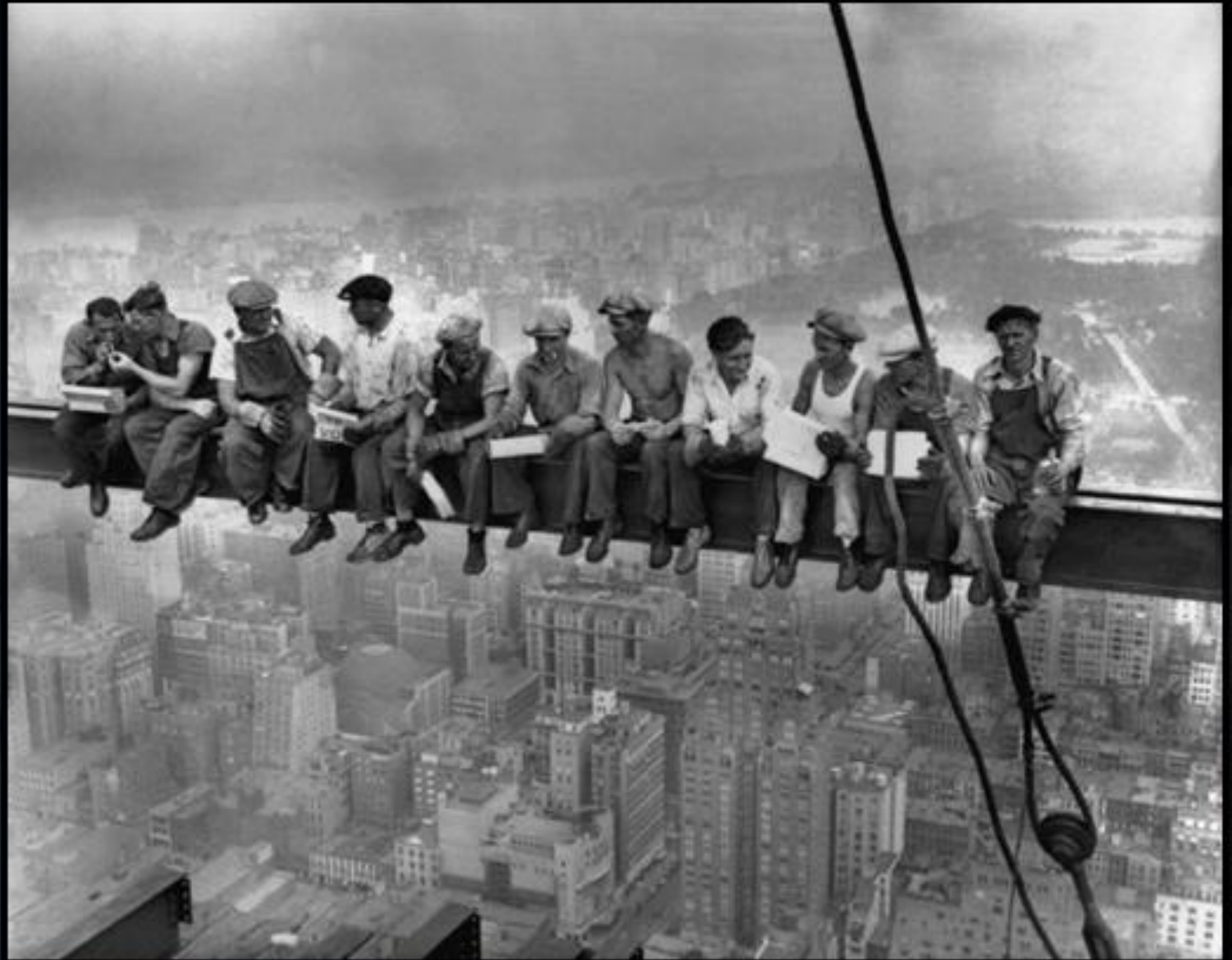
Lunch atop a Skyscraper, 1932